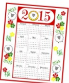
Year of the Sheep 2015 Printable Calendar www.123print.com